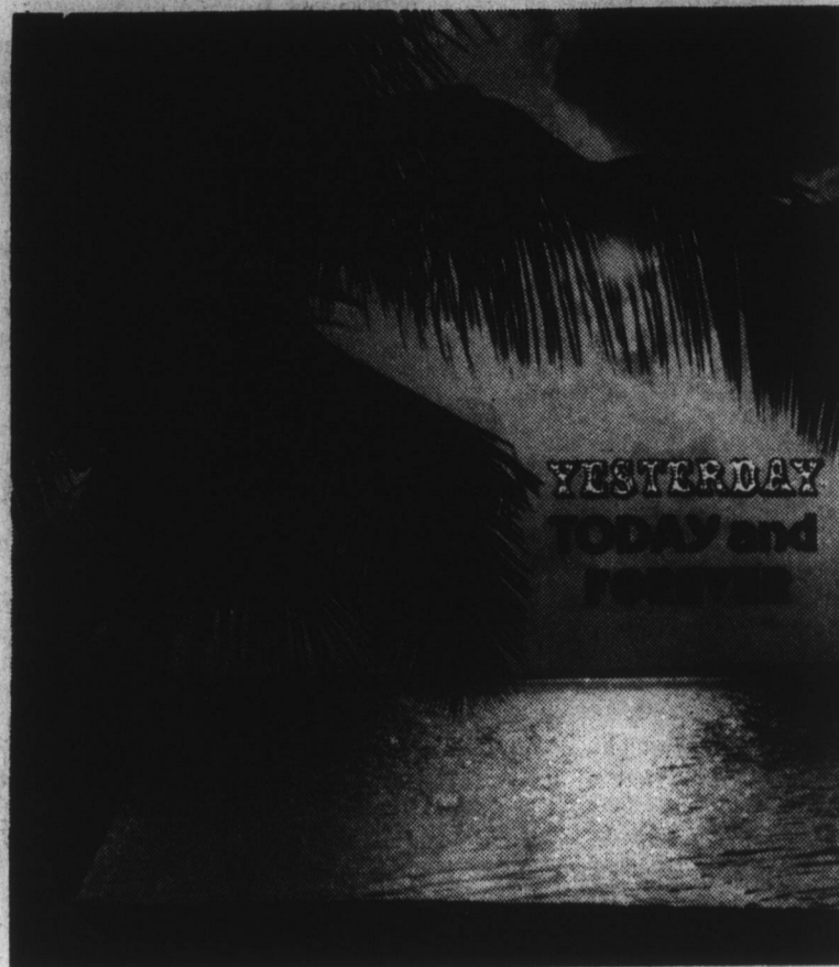
Christopher Columbus had trouble recruiting sailors for his early voyages. Men were afraid, but the bravest enlisted and sailed off to the wonders of a new world.

Most of us are afraid of the unknown. We have our qualms and doubts about a new job, moving to a strange city, beginning a marriage, or simply facing the uncertainties of tomorrow. We do not know what lies ahead, and we worry about being able to cope with it. In this ever-changing world, we instinctively yearn for that which does not change.