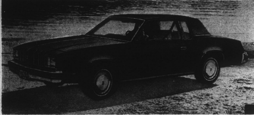
A new diesel engine (top photo) and a completely redesigned Cutlass highlight Oldsmobile's 1978 offerings. The engine, the first domestically-built diesel available in a U.S. passenger car, provides outstanding fuel economy. This 5.7-litre V-8 General Motors diesel engine is optional on Oldsmobile's 1978 Eighty-Eights, Ninety-Eights and Custom Cruiser station wagons. The new Cutlass is fuel-efficient, offers interior and luggage roominess plus excellent handling and riding comfort. The Cutlass lineup features eight models, including the Cutlass Supreme (lower photo). Oldsmobile General Manager Robert J. Cook expects Oldsmobile dealers will sell a record 1.1 million cars during the 1978 model year.