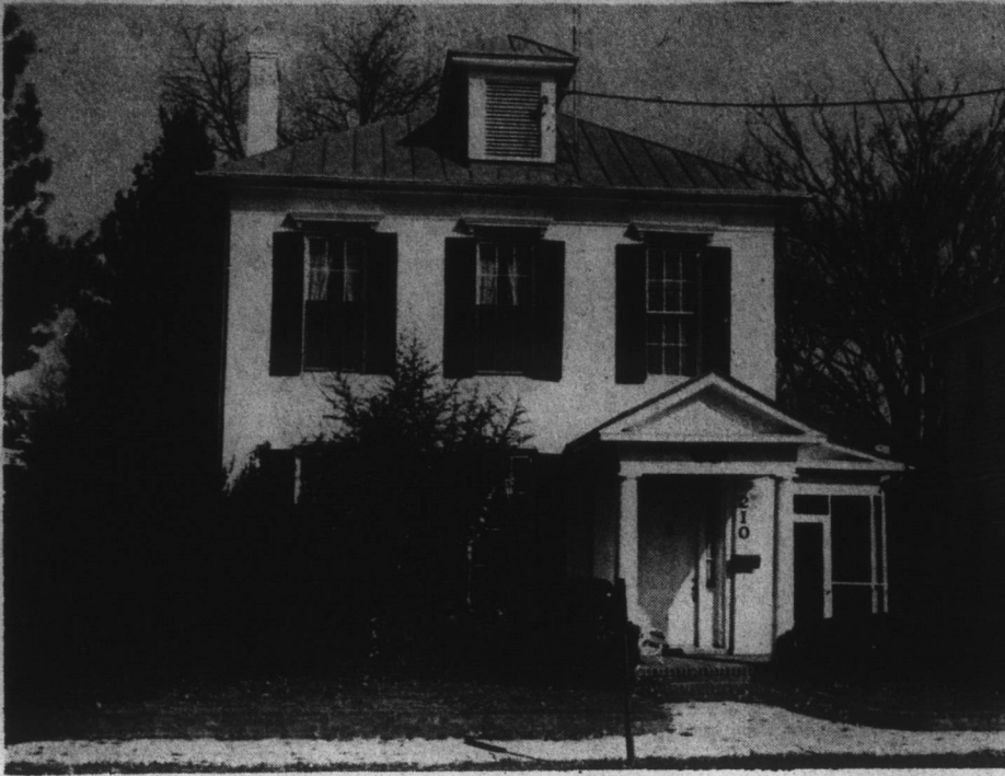
The Norfleet House in Suffolk, Va.