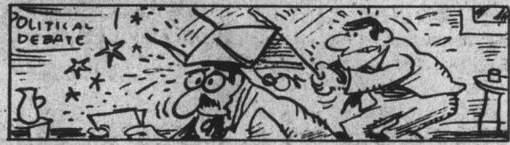
The word debate comes from the Old French for "to strike down."