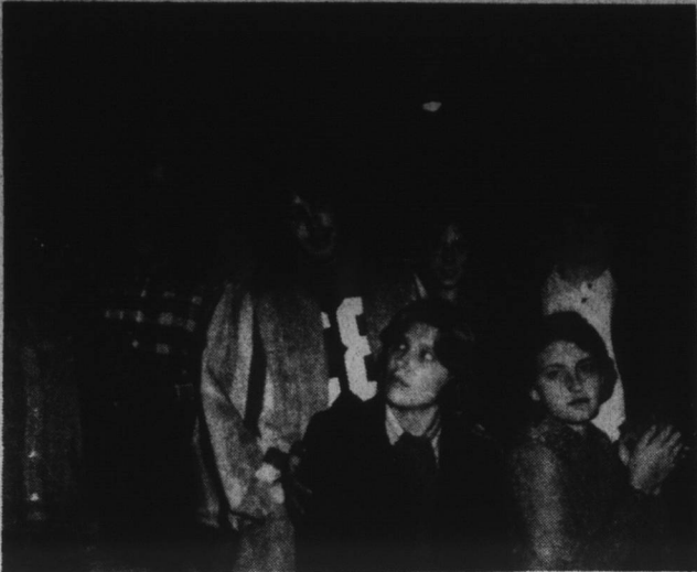
IN REHEARSAL — Members of the John A. Holmes High School Drama Club strike a dramatic pose during rehearsals. The play production of "Love Is Better Than The Next Best Thing" will be taken on tour to Knapp Junior High School, Manteo High School and Currituck High School on Dec. 2, 8, and 9.