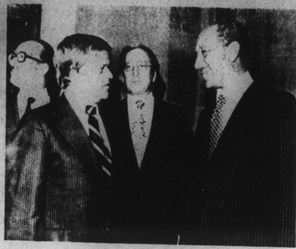
SENATOR ROBERT MORGAN (D-NC) greets President Sadat (right) of Egypt in the nation's capitol on the day after Sadat and Prime Minister Begin of Israel had signed an agreement to seek peace in the Middle East. Between the two is Senator Sam Nunn (D-Ga).