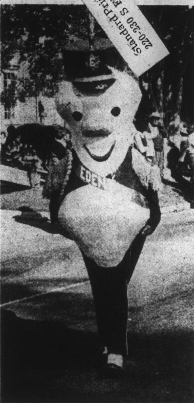
Special 'Mr. Peanut'