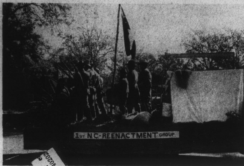
Prize Winning Float