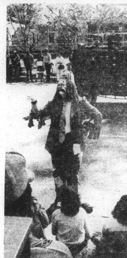
One In Every Crowd