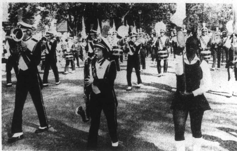
The Marching Aces