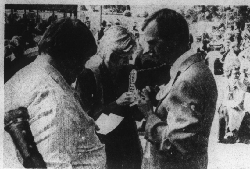
Documenting Band Winners