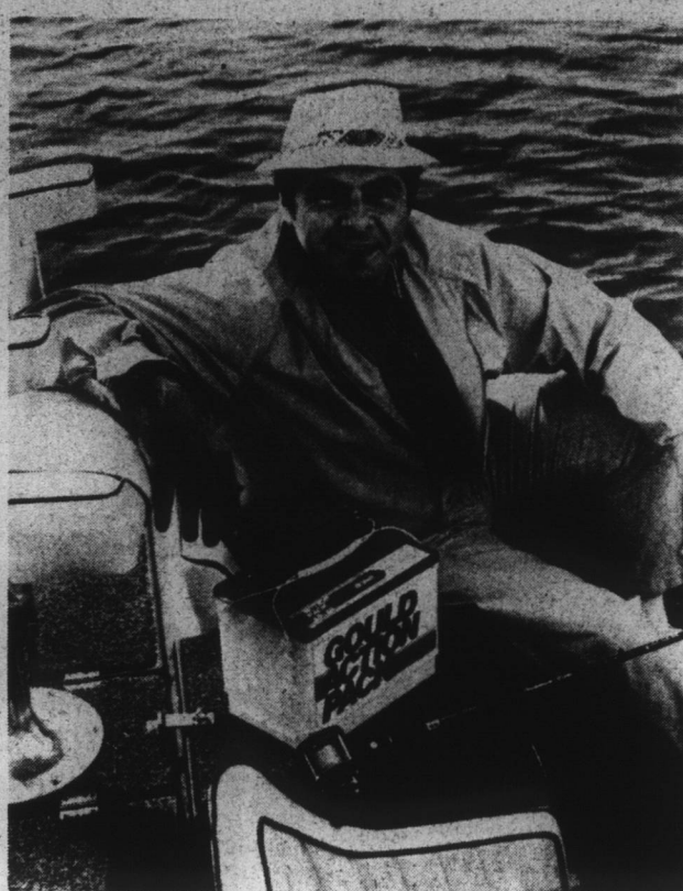
CHOICE FOR TOURNEY — The Bass Anglers Sportsman Society designed the Gould Action Pack deep-cycle battery, the official battery of the Eighth Annual Bass Masters Classic tournament to be held October 25-27 at the Ross Barnett reservoir in Jackson, Miss.

Southwestern Section — Demand for Southwestern grown peanuts was light for very limited offerings during the week ending October 12. Trading was inactive at unchanged prices. Harvesting in south Texas was just about complete. Central Texas growers moved steadily ahead. The Oklahoma harvest progressed slowly while New Mexico growers moved rapidly ahead. Sales of Spanish and Runner type peanuts were too few to quote. Prices paid per pound for unshelled Valencia type peanuts sold on an FOB shipping point basis for October-November shipment were mostly 35 cents.