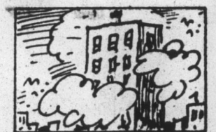
The first true skyscraper using a steel skeleton for support was the Home Insurance Company Building, built in Chicago in 1885.