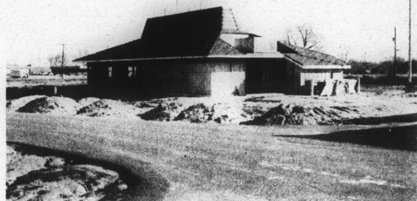
Building of Edenton United Methodist now going up on Virginia Road. The new Pizza Hut addition to Edenton Village Shopping center is at top right. Below is the new Chowan County Court-house-Detention Facility project in downtown Edenton.