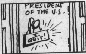
The first vice president of the United States to resign from office was John C. Calhoun in 1832.