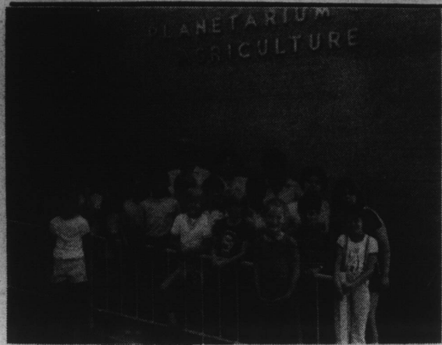
FIELD TRIP - Pictured above are some Third Graders from White Oak Elementary School with their teachers and aides while visiting the Chesapeake (Va.) Planetarium.

A qualified individual with WSI in swimming is needed to teach swimming lessons for small children. Lessons will be given at Sandy Point Beach. Anyone interested