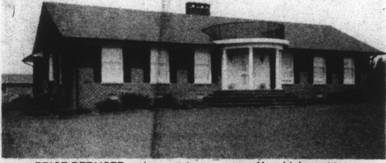
PRICE REDUCED - Immediate occupancy. Very high quality. Now only $75,000.