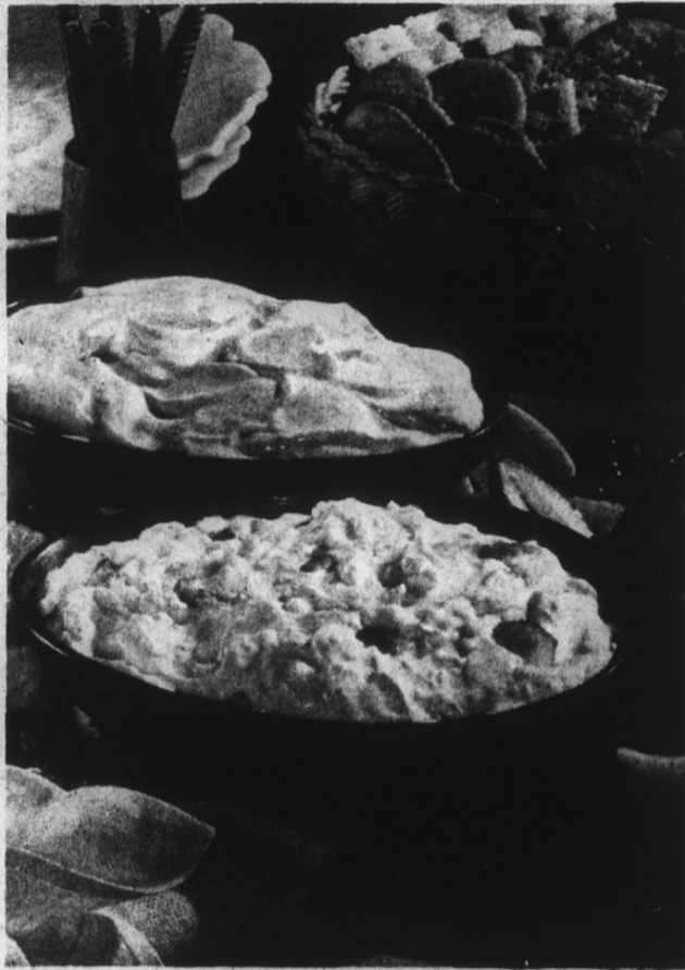
SNACK DIPS — Keep a couple of tasty dips in the refrigerator to serve at a moment's notice when the youngsters ask for a snack or when unexpected guest drop in. Pass them on a tray with fresh fruit, crackers and chips.

Sincerely, James G. Krom Route 3, Box 120 Kingston, N. Y. 12401