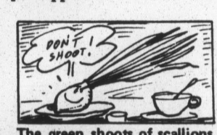
The green shoots of scallions are more nutritious than the bulbs.

Sherbet and fruit combinations make a cooling appetizer or dessert. Specialists with the N. C. Agricultural Extension Service suggest these combinations: raspberry sherbet with raspberries or sliced peaches, lemon sherbet with strawberries or raspberries, lime sherbet with crushed pineapple, pineapple with strawberries or orange sherbet with sliced bananas or crushed pineapple.