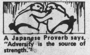
A Japanese Proverb says, "Adversity is the source of strength."