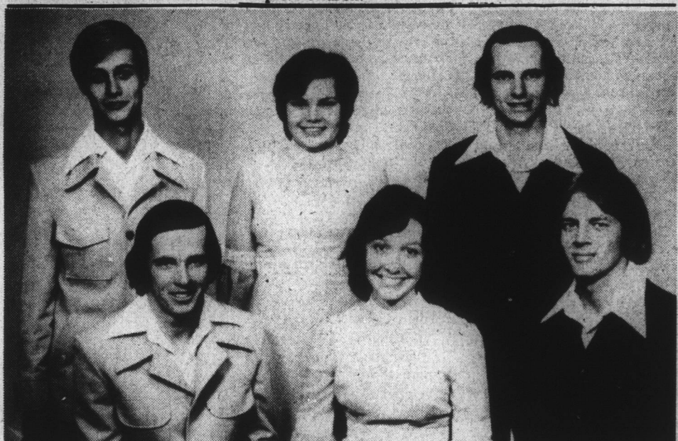
NEW LIFE SINGERS — The New Life Singers from Daniel's Chappell Free Will Baptist Church will be at the Cape Colony Free Will Baptist Church Saturday. The program starts at 7 P.M. The public is invited to attend.

A reception will follow in the school gymnasium. The public is invited to attend.