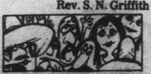
Mexico had the world's largest annual population increase from 1970 to 1978: 3.5 percent.

exhaust-system leaks. -Take advantage of the thorough safety inspection offered by the Coast Guard Auxiliary. The Auxiliary offers free safety instructions.