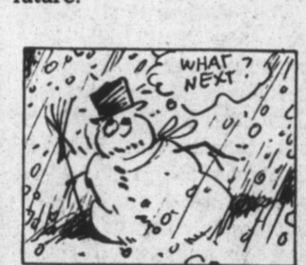
On Jan. 31, 1925, gray snow fell in Japan—a mixture of snow and ashes from nearby volcanoes.

Patron support is $25 per person for the three concerts and will assure the success of this year's programs. It will also enable the association to broaden the series in the future.