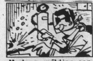
Modern welding can make a joint stronger than the metal itself.