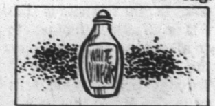
Hand washing? White vinegar in the rinse water will cut down rinsing.