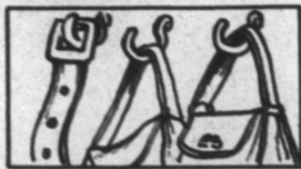
Hang handbags and belts from large shower curtain hooks on closet rods.

During the training, students received instruction in drill and ceremonies, weapons, map reading, tactics, military courtesy, military justice, first aid, and Army history and traditions.