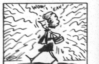
It takes the fragrance of the average perfume four hours to fade.

The faculty and students of the school extend their congratulations to her.