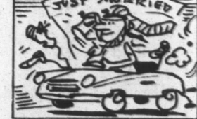
The custom of throwing old shoes or tying them to the bridal car after the wedding dates back to ancient Egypt.