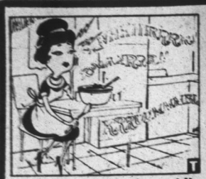
To help protect the public against unacceptable levels of noise, a new noise-measurement computer program has been developed.