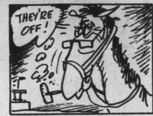
Hickory Jim, the oldest race horse in history, won his last race in 1891 at the age of 25.