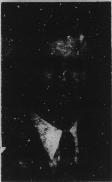
Gov. Jim Hunt

Governor Jim Hunt will be the guest of honor at a pig-picking on Thursday, January 10. In