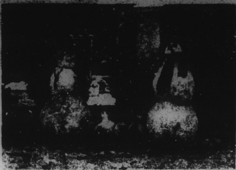
FIRST SNOW — The first snow to fall on Chowan County since last year came a day later than the weatherman predicted, but by late Saturday afternoon, locations in Northeastern North Carolina reported accumulations up to four inches. While no serious accidents were reported locally, a number of hapless drivers found themselves in ditches because of the slick road conditions. By