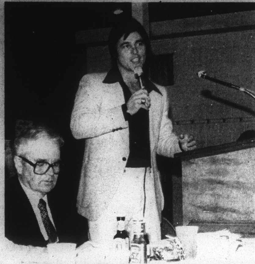
GUESTS OF ACADEMY — Bucky Dent, New York Yankee's shortstop, left, and Jim "Catfish" Hunter, former Yankees pitcher, right, were guests of the Chowan Academy PTO at a steak supper held last Thursday night at the Edenton National Guard Armory. The annual supper is a fund raising project of the Parent-Teacher Organization.