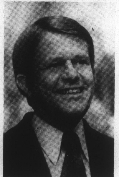
Sen. Robert Morgan