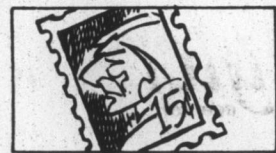
Modern postage stamps came into use in 1840.

Swindell-Bass Funeral Home was in charge of local arrangements.