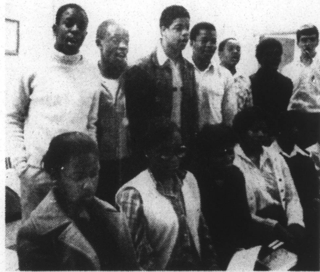
MIXED CHORUS II students, especially the male singers, give a lusty performance, while the girls await their musical entrance to provide the harmony and lightness needed to produce a choral masterpiece.