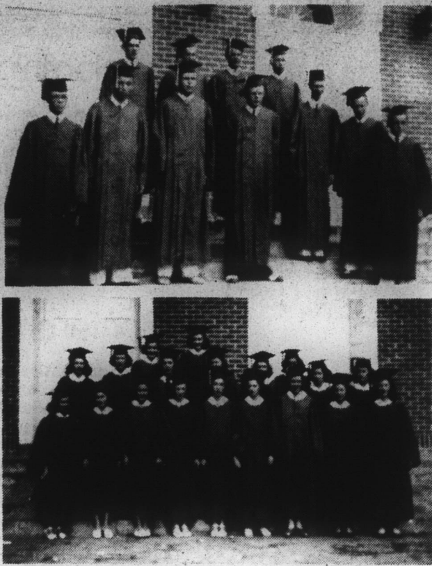
ALUMNI WEEKEND SET — Pictured above is the Chohan High School graduating class of 1942. It is hoped that many of this class, as well as members of other classes from 1922-1980 will participate in the Alumni Weekend to be held April 25, 26, and 27 at the school. Persons who attended Chohan High School but did not complete the twelve years there are encouraged to attend and renew friendships.