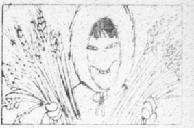
Hardy varieties of oats are grown almost to the Arctic Circle.

involving inspection and review functions of Public Housing Agencies, will likely be the next workshop topic. Announcements will be forwarded to all such agencies in the state.