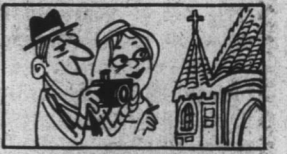
U.S. consumers spend only a third as much ($5.1 billion) on foreign travel as they do on religious and welfare activities ($15.4 billion).

ARTS & CRAFTS — These classes will begin June 16 and last for a period of eight weeks, ending August 7. Classes will be held for ages 6-10 on Mondays and Wednesdays between 2 and 3:00. Classes will be held for ages 11-15 on Mondays and Wednesdays also, beginning at 3:00 and lasting for one hour.