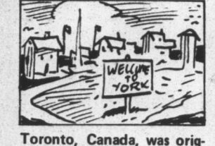
Toronto, Canada, was originally named York.

Sofa bed, adult swing set, book-cases, double bed complete with springs and mattress. Other miscellaneous items. Call 482-8190, Country Club Drive.