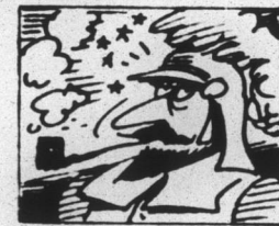
Tobacco was first used medicinally as a headache cure by the Conquistadores.

Plans were made for the 1981 reunion before the group departed after an afternoon of good fellowship.