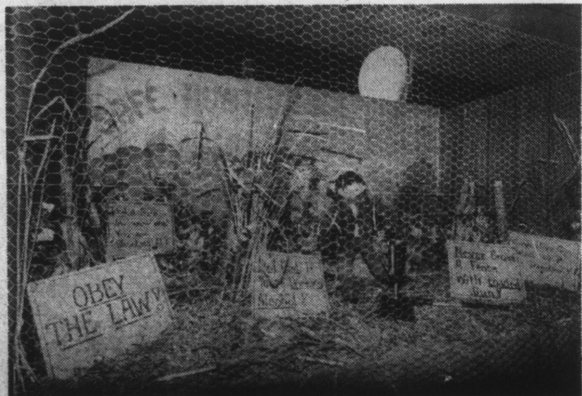
CHOWAN COUNTY FAIR IN FULL SWING — Exhibits at the Chowan County Agricultural Fair this week have been termed "fantastic" and are expected to draw record crowds. Yeopim 4-H'ers won the Grand Champion designation in educational

Archives and History's long-range program to identify and document historic properties in North Carolina. Approval of the nomination by the Department of the Interior usually takes about six months and will be announced through the state's congressional delegation.