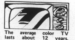
The average color TV lasts about 12 years.