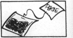
Cold tea is a good cleaning agent for varnished floors or woodwork of any kind.

Enshrinement ceremonies will be held at 3 P.M. in the State Archives and History Building. Gov. James B. Hunt and former Gov. Robert W. Scott will present the Hall of Fame Citation.