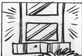
A half cup each of ammonia and white vinegar, plus two tablespoons of cornstarch in a bucket of warm water can make a good window washing solution.