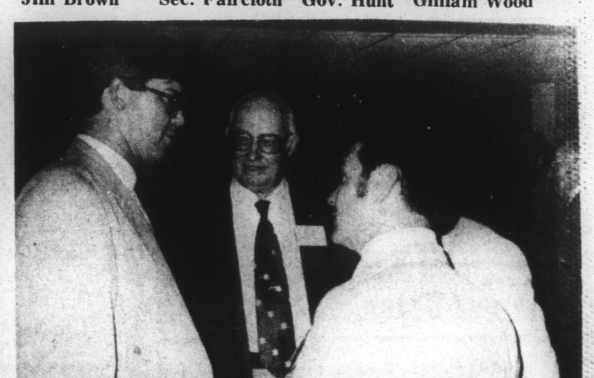
Rep. Charles Evans