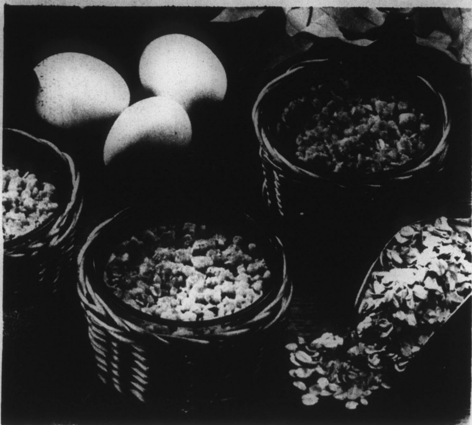
NUTRITIOUS DESSERT — Apple Crisp Custards are nutritious as well as delicious and are highly favored as an autumn dessert.

ready-to-serve popped corn. The company has pointed out, however, that the popcorn is grown especially for use in the microwave oven. Hungry Jack Microwave Popcorn is designed for use in microwave ovens with an output of at least 600 watts.