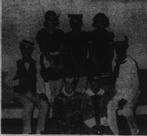
Virginia Beach Community Ballet Company

Women were in attendance from all over the United States.