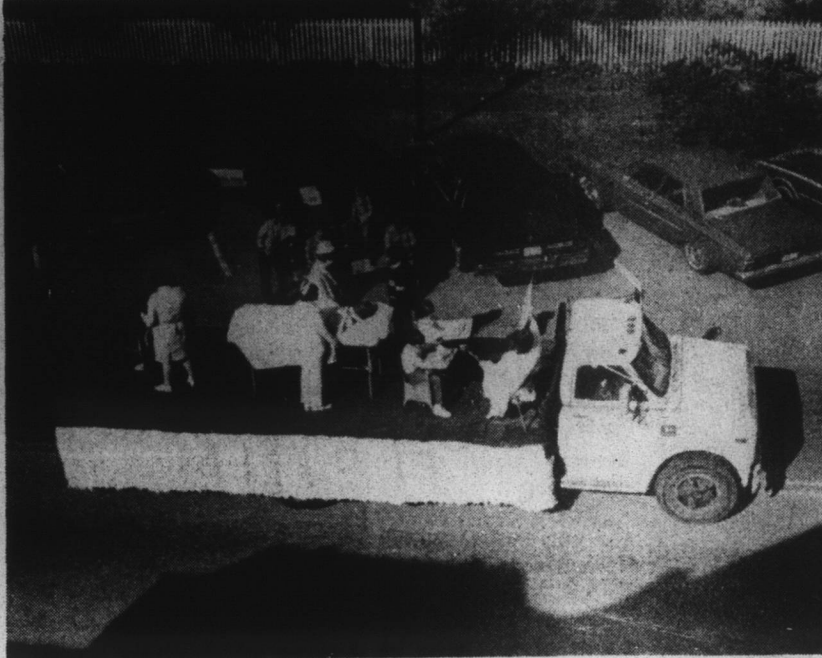
HOSA RECEIVES THIRD PLACE — The HOSA float entered in this year's parade received the third place award in float competition. The operating - room scene was well-received by the many onlookers who turned out for the parade.

The world is filled with people who don't know as much as they think they know.