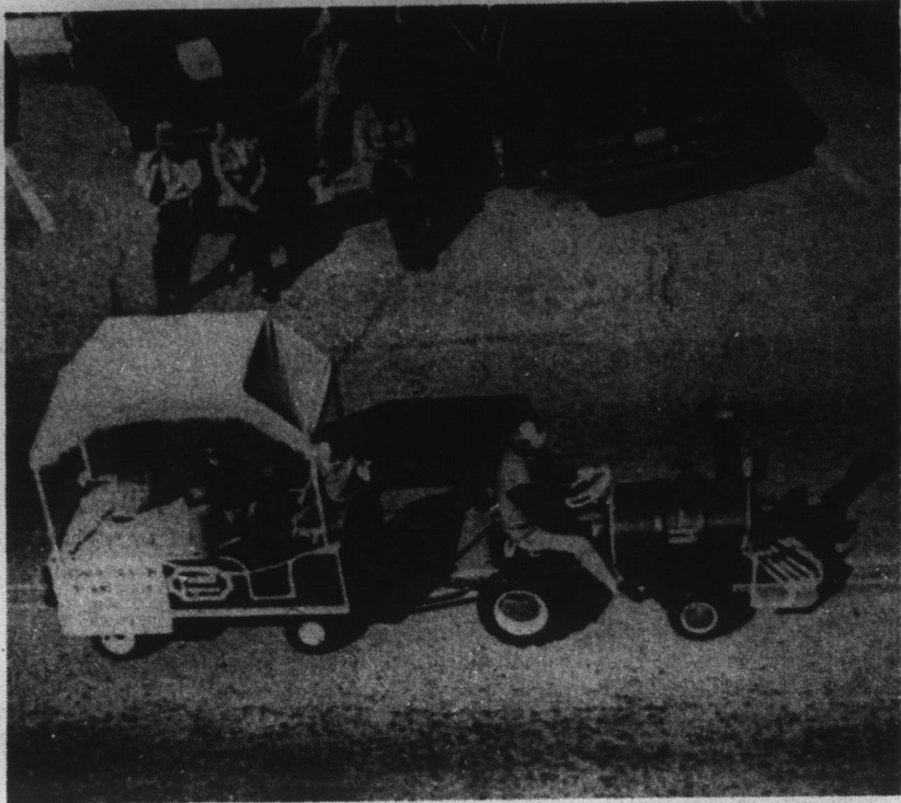
OPTIMIST CLUB FLOAT — The Optimist Club entered a float in this year's competition and received a second place award. This was one of the longest parades in recent memory, lasting well over an hour.

The Navy announced recently that "punitive letters of reprimand" have been issued to the skipper and a deck officer for failures in the collision of their nuclear-powered submarine with a Japanese freighter.