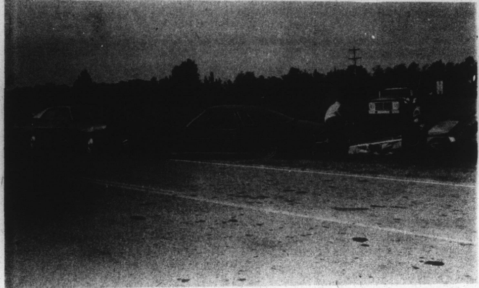
IS THIS ACCIDENT REAL? — This scene took place last week as a "fake" accident was staged to test the Chowan County Sheriff's Dept., Highway Patrol, Rescue Squad's and hospital personnel. The hospital staff will evaluate the performances and work to improve those areas that need it.