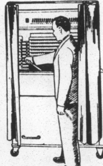
VOTER ABOUT TO CLOSE CURTAIN

Each candidate's voting pointer is located just above his name; a voting pointer must be turned down over the name of each candidate for whom you wish to vote, AND LEFT DOWN.