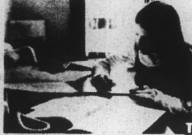
Woman on the job... a picture that's not likely to change.

To obtain a free copy of the report, write: General Mills, Box 6, Dept. 760, Minneapolis, MN 55460.