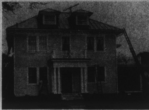
The Charles Creighton Home