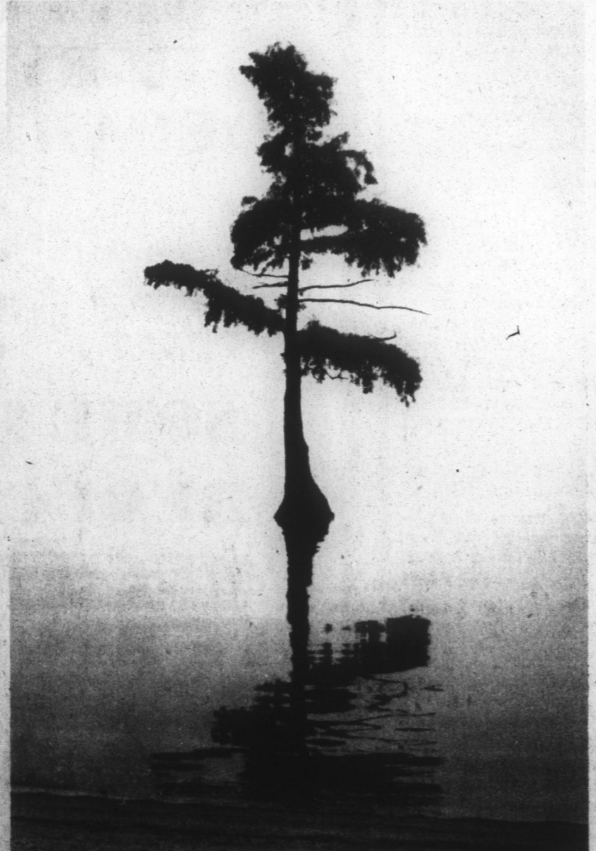
CYPRESS SENTINEL — The weather these days may be changeable from spring-like sunniness to depressing cold rain but even a foggy, gray day on Albemarle Sound presents a peaceful scene of silhouetted cypress near the railroad bridge. Photographer Jack Williams of Elizabeth City welcomed this site after days of hectic turnpike traffic in the Northeast. When he dashed across a sleet covered highway to help a driver out of an asphalt truck which had overturned after crumbling a car, and found the Lord was with the unscathed driver that day, covered as he and the road were with hot asphalt, Jack turned his wheels toward the Chesapeake Bay Bridge and the cypress-lined shores of Carolina. He'd like to put Christmas tree lights on all those cypress.

Gov. Jim Hunt has the option of calling for a statewide referendum on issuing new Clean Water Bond Act bonds.