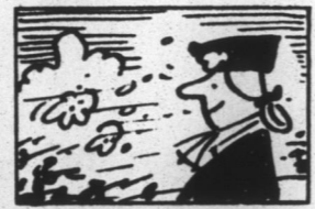
The Battle of Bunker Hill was unique in that thousands of spectators in the Boston area had ringside seats for the spectacle. They sat on rooftops, in tree-tops, on church steeples, and in the rigging of the ships in the harbor.

1, 2, 3, 4 & 5 acre wooded tracts. Commercial and residential.