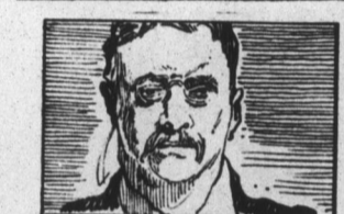
New York state leads the nation in percentage space devoted to state parks. Much of the thanks goes to a crusade by Theodore Roosevelt, who established the national park system.

Don't forget our Covered Dish Dinner following the Worship Service Sunday (31st). You may bring your dish or dishes with you - put them in the refrigerator or on the stove - or you'll have time to go home and get them. Join us in this time of good food, fun and fellowship.