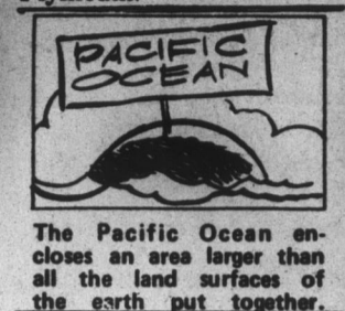
The Pacific Ocean encloses an area larger than all the land surfaces of the earth put together.