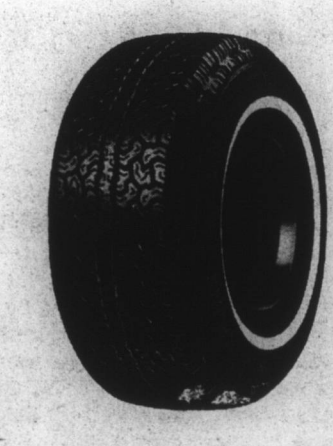
Multi Season Radial