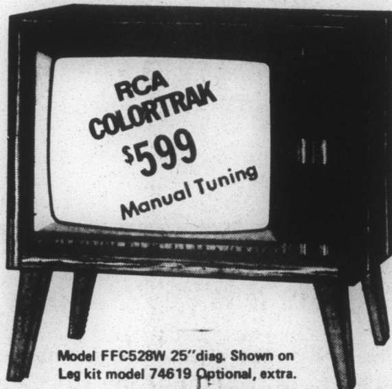
Model FFC528W 25" diag. Shown on Leg kit model 74619 Optional, extra.