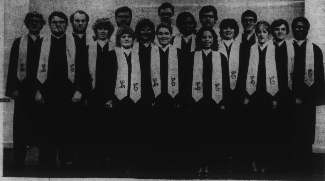
The Louisburg College Ensemble