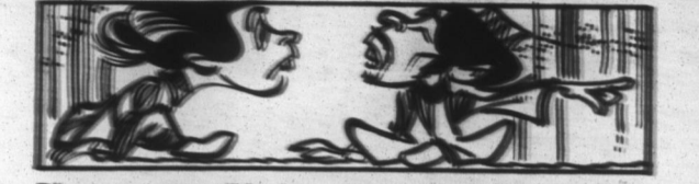
Divorce was possible in early China. However, a man could not divorce his wife if she had no family to return to, she had shared his three year mourning period for his parents, or she had married him when he was poor and he had since become rich.