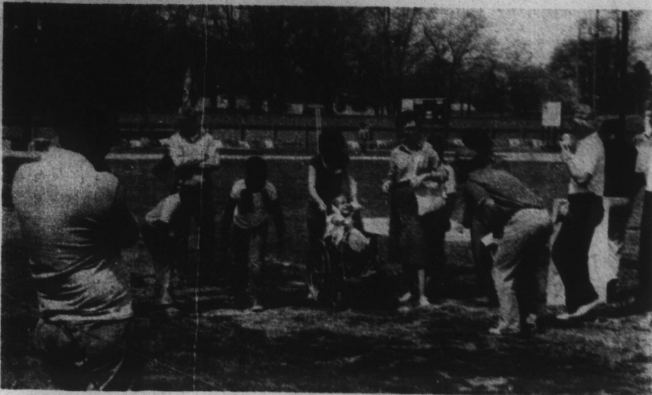
SPECIAL OLYMPICS — The Chowan-Edenton Optimist Club invites the public to attend the Second Annual Chowan County Special Olympics this Saturday (March 27) at Hicks Field beginning at 10 A.M. All volunteers are requested to appear at Hicks Field at John A. Holmes High School before 9:30 A.M. to receive their assignments.