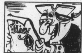
The first life insurance policy issued in the U.S. was issued by the Insurance Company of North America in Philadelphia in 1792.